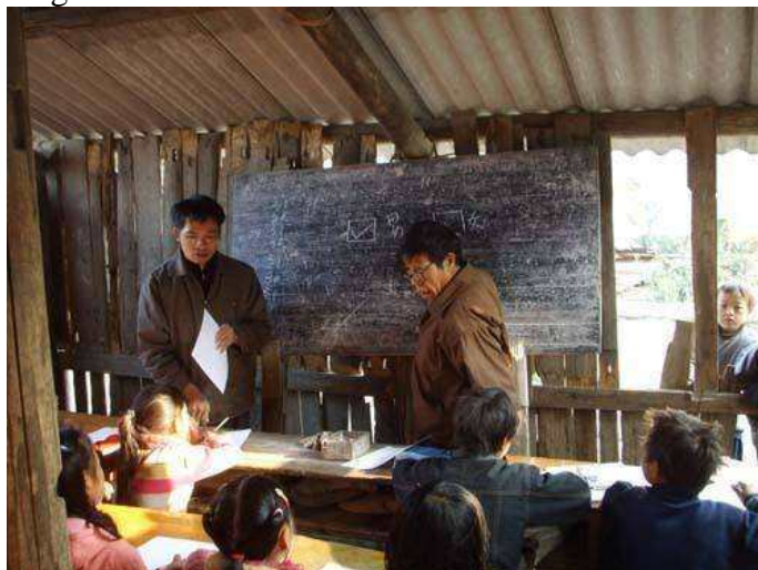
Figure 2: Poor Teaching Environment in Poverty-stricken Areas

important problem for the government to solve.